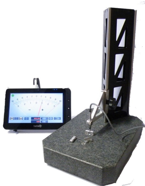
Two-point measurement station

The LNP measuring table is suitable for a variety of measurement tasks. It impresses with its elegant design and its high rigidity.