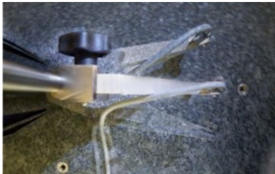
swivel range of the quick-action fixture

These characteristics are induced by its innovative triangle shape. Our product is mainly characterized by its flexural rigidity and its continuously pivoting quick action fix.