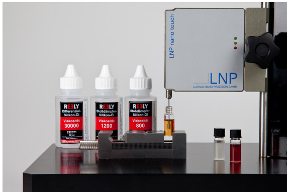
Viscosity measurement with LNP nano touch